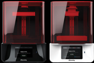
Pro 95 or Pro 55