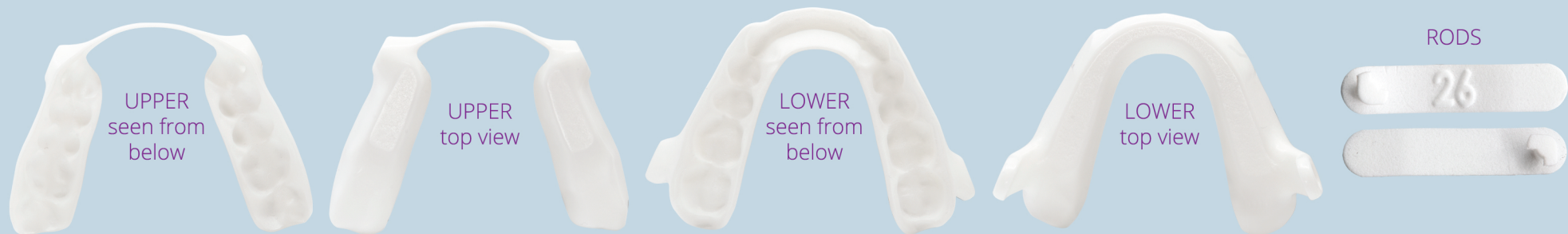
UPPER seen from below